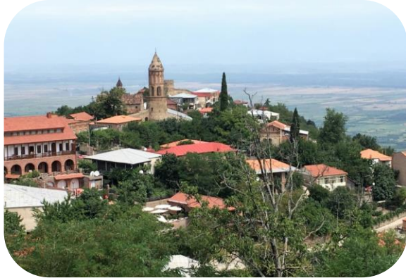
View of Telavi