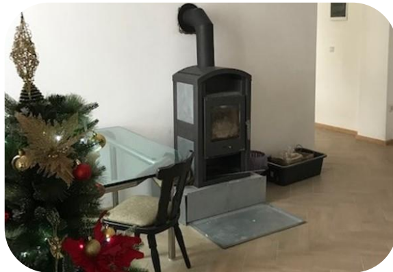
Interior of the administration building