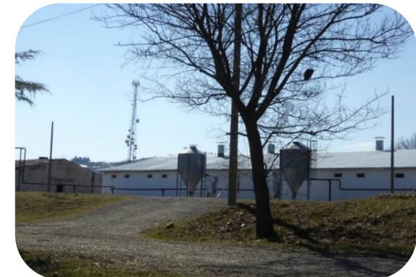
Poultry production building